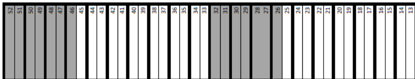
RV Site Area *50 amp